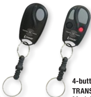
Single-button TRANS PROX™ Model # ACT-31DH Part #ACP00957