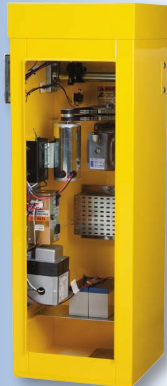
BGU-D Full-time DC powered battery backup