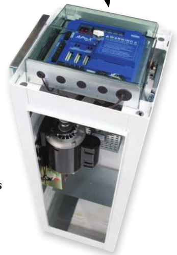
Model BGU top view