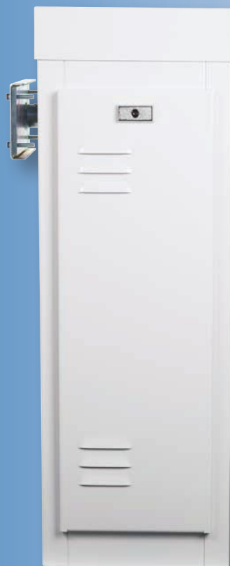
BGU 115 VAC