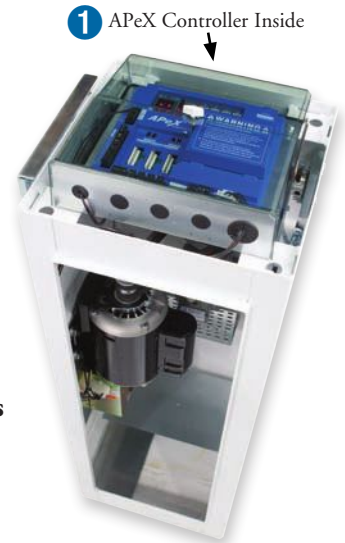
Model BGU top view