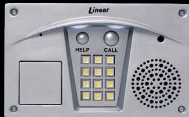
RE-2 STAINLESS STEEL