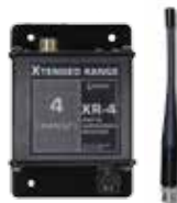
XR-4 4 Channel Receiver