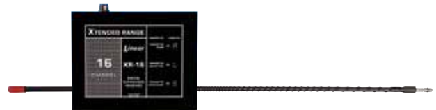
XR-16 16 Channel Receiver

Size: 4.25 x 6.25 x 2.5 in (108 x 159 x 64 mm)