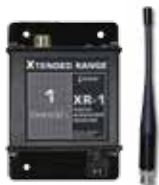
XR-1 1 Channel Receiver

Note: Requires ANT-1A or ANT-2 antenna kit