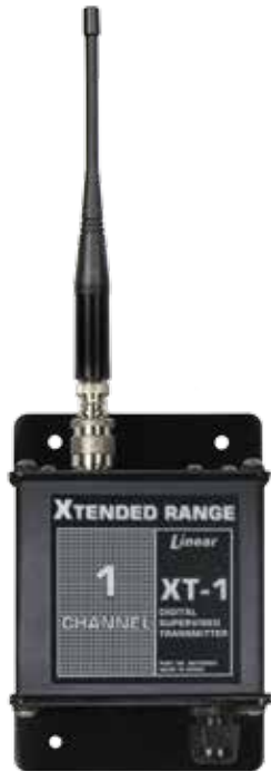
XT-1 1 Channel Transmitter

Note: Requires ANT-2 antenna kit for proper operation