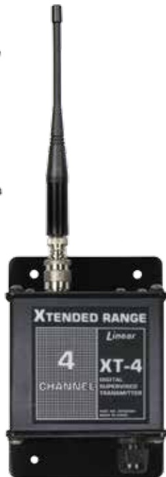
XT-4 4 Channel Transmitter